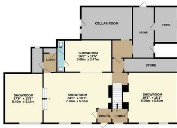
TOTAL FLOOR AREA : 4524 sq.ft. (420.3 sq.m.) approx.

Whilst every attempt has been made to ensure the accuracy of the floorplan contained here, measurements of doors, windows, rooms and any other items are approximate and no responsibility is taken for any error, omission or mis-statement. This plan is for illustrative purposes only and should be used as such by any prospective purchaser. The services, systems and appliances shown have not been tested and no guarantee as to their operability or efficiency can be given. Made with Metropix ©2025